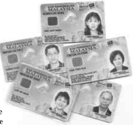
Holders' personal data is encoded on the square-shaped chip located on the left.

As religion is a personal matter for the individual, and as the provision for religious freedom in Article 11(1) of the Federal Constitution supersedes NRD regulations, there is therefore no necessity to prove religion (baptism certificates or declaration forms) as a procedural or evidential matter.