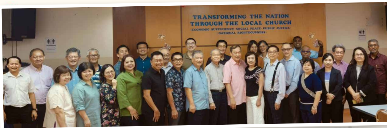
NECF Thanksgiving Lunch with NECF Council and Ex-Council Members, NECF Staff, Commission Members & Legal Team.